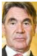
Templeman: 'Growth boosting'

and cause havoc and chaos in the health and education sectors."