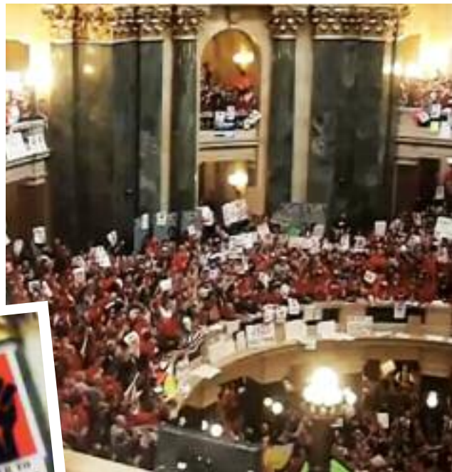
The balloon goes up: See how protestors inside the Capitol building in Madison, Wisconsin, above, gave their 'People Power' message, left, some wings...

http://www.youtube.com/watch?v=2X5PVNu1in8