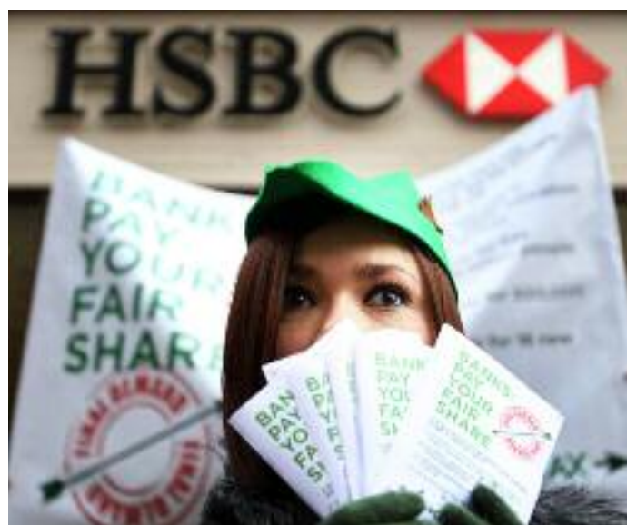
Robin Hood Tax campaigner outside bank in Glasgow earlier this month