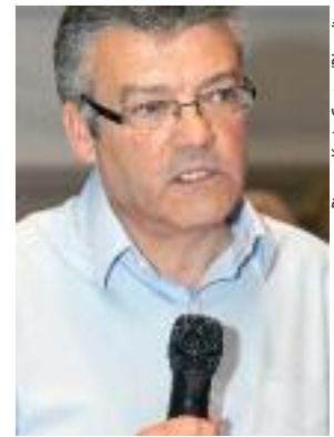
Campfield: Executive call

The Robin Hood Tax campaigners have called on countries that levy the tax to keep half of the sum raised for domestic use and split the rest between poverty reduction and tackling climate change.