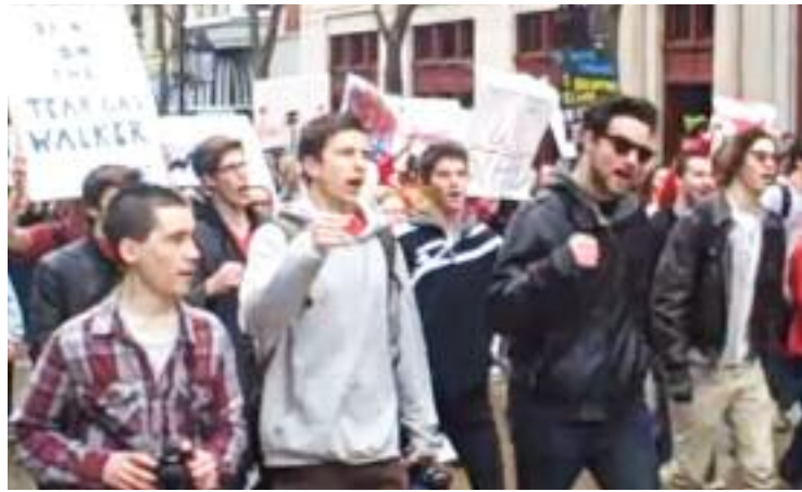
Thousands of University of Wisconsin students skipped lectures to join rally

TENS of thousands of trade unionists, students and their supporters have taken to the streets of Madison – Wisconsin's state capital – in a series of marches over the last few weeks in protest at an unprecedented attack on collective bargaining rights.