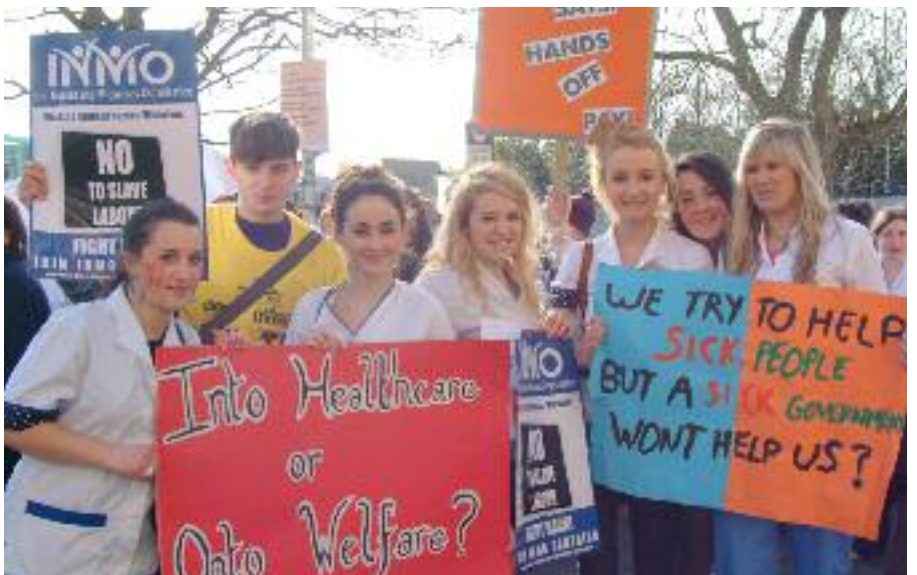
Nursing a real grievance: INMO student nurses on the February 16 demo