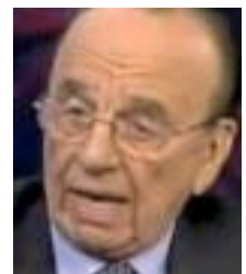
Murdoch: Vast profits