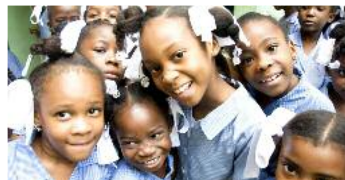
Students at the Ecole Anne Marie Javouhey in Port au Prince

Pointing out that jobs were "the biggest challenge" for any new administration, he added: "It [new government] must stop deflating the economy and invest €2bn a year from the Pension Reserve into the real economy for the next three years and renegotiate the so-called 'bailout' of the private sector banks."