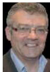
Campfield: 'Havoc & chaos'