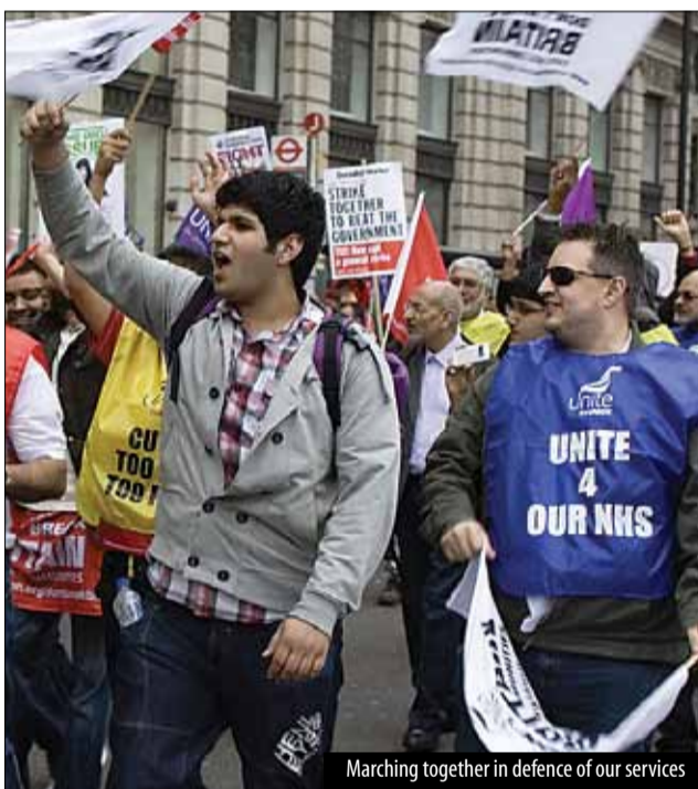
Marching together in defence of our services

The cuts are designed to complete the job which Thatcher set out to do — destroy the welfare state and sell off any valuable assets to their pals. The