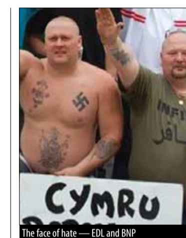
The face of hate — EDL and BNP

They also hope that their previous lack of success in Wales