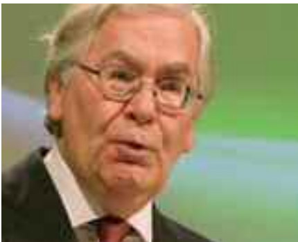
Lions' den: Mervyn King spoke to TUC