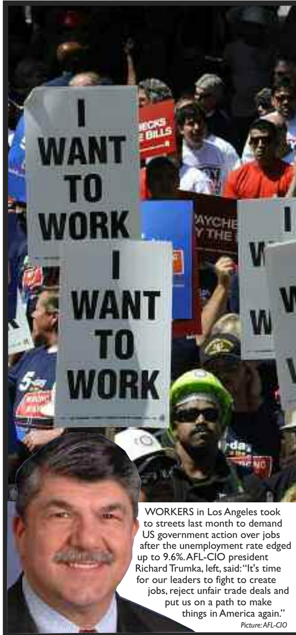
WORKERS in Los Angeles took to streets last month to demand US government action over jobs after the unemployment rate edged up to 9.6%. AFL-CIO president Richard Trumka, left, said: "It's time for our leaders to fight to create jobs, reject unfair trade deals and put us on a path to make things in America again."

"The Department of Employment & Learning will now pay up to eight weeks pay to the former workers at J&G."