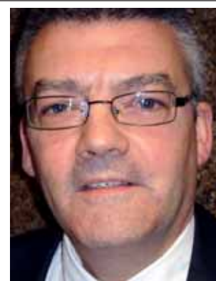
Campfield: 'Honoured' by vote

He said: "The PPEF is anxiously awaiting an outline of the exact details of the appointment of 100 teachers. But this is only a gesture and it will not go far in terms of ensuring all of our young people get the education they need."