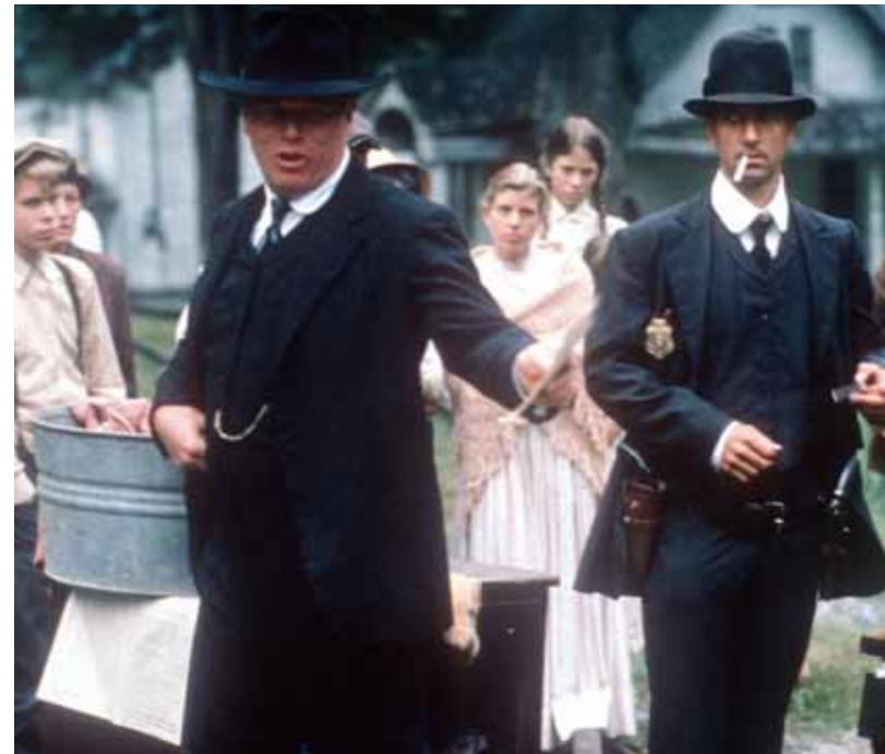
Tough guys: Company enforcers lay down the law in scene from Matewan

"Remove the 'caste' designations of 'Catholic' and 'Protestant' and you are left with occupations – teacher, taxi driver, homemaker. What they had in common was that they were workers. What made them stronger as workers was this commonality and it is through this commonality that we remember them today."