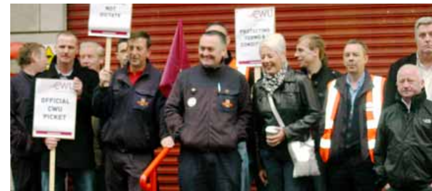
Belfast posties on the picket line last month

Royal Mail calls it "absorption," meaning, according to one London representative: "You've got to take on someone else's round at no extra pay – if someone can't do their round for whatever reason, their work is just 'absorbed' into yours." Deregulation is forcing Royal Mail