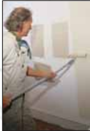
Painter & Decorator