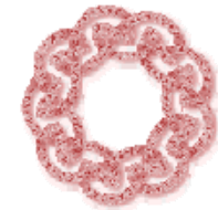
Scottish Association of Chaplains in Healthcare