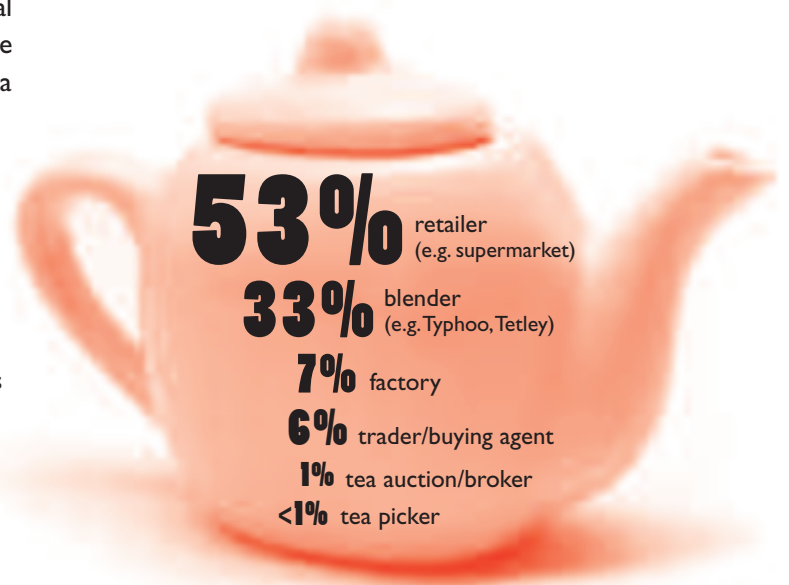
Figure 1: Who makes money from your cup? 8

Very little of the profits included in the retail price of a box of tea goes to the tea-producing country. Instead, whilst multinational corporations reap large rewards, tea workers are condemned to a life of penury. A tea picker makes just 1p for each £1.60 box of tea bags sold in a British supermarket.